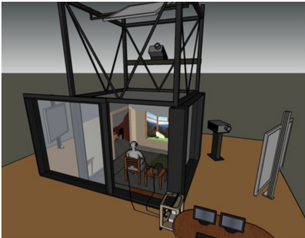
Figure 1. Schematic of the control room (VisRoom) and the DiVE cube with a human participant viewing a virtual scene.

Virtools communicates with the tracking system through the Virtual Reality Peripheral Network (VRPN 15 ), an open source library. VRPN registers the participants head and hand location and orientation as well as button press information. Virtools uses the head tracking information to render the 3D scene at the correct perspective for the participant.